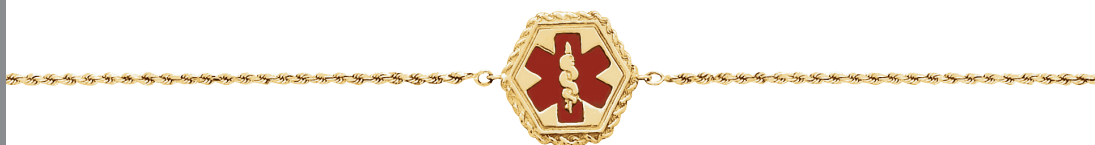
CH75 14kt 7", $1,129, 3.04 dwt