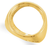
9119 14kt United States, $5.00 Indian, 21.5x1.7 Liberty, 21.6x1.5 21.4 width $2,785, 11.01 dwt