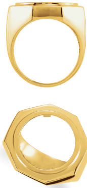
9118 14kt United States, $2.50 Chinese Panda, 1/10 ounce 17.8 width $2,679, 10.58 dwt