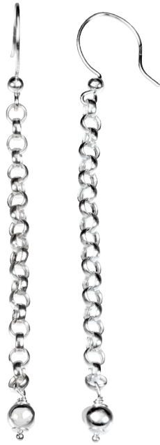
24953 sterling silver stacker earring, 88.9 $76, 0.78 dwt