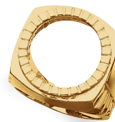
9275 14kt United States, $2.50 Mexican, 1/10 ounce 17.8 width $2,655, 10.49 dwt