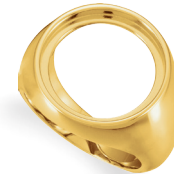
9120 14kt United States, $2.50 Chinese Panda, 1/10 ounce 18.0 width $2,325, 9.15 dwt