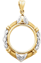
21869 14kt American Eagle, 1/10 ounce 0.04 ct tw, 16.4x11 $969, 2.20 dwt