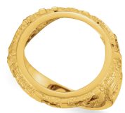
9179 14kt United States, $2.50 Chinese Panda, 1/10 ounce 18.0 width $1,605, 6.25 dwt