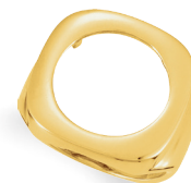
5213 14kt Chinese Panda, 1/20 ounce Isle of Man Cat, 1/25 ounce 13.0 width $1,019, 3.91 dwt

Most items available in any metal quality.