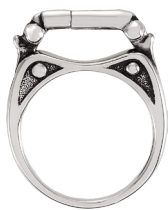
6564 sterling silver ring $79, 2.51 dwt