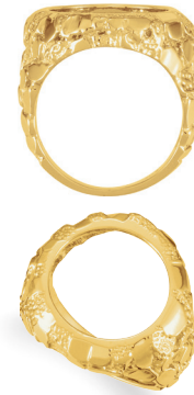
9270 14kt United States, $2.50 Chinese Panda 1/10 ounce 17.8 width $2,129, 8.37 dwt