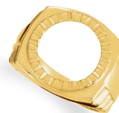
9273 14kt United States, $1.00 type 3 Mexican, 2 peso 15.0 width $2,229, 8.78 dwt