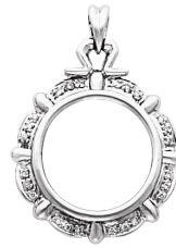
21870 14kt American Eagle, 1/10 ounce 1/8 ct tw, 16.4x11 $1,215, 2.60 dwt