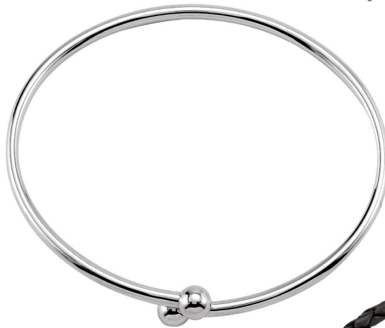
BRC548 sterling silver snake bracelet, 7" $69, 4.45 dwt