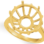
7583 14kt United States, $1.00 type 1 Mexican, 2 peso 13.0 width $625, 2.33 dwt