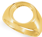
9114 14kt Chinese Panda, 1/20 ounce Isle of Man Cat, 1/25 ounce 13.9 width $1,465, 5.69 dwt