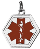
1261 sterling silver 21.0 width, bail ID 3.25 $159, 2.76 dwt