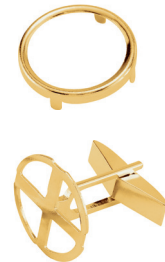
2896 14kt American Eagle, 1/10 ounce 16.5x1.2 $579, 1.83 dwt