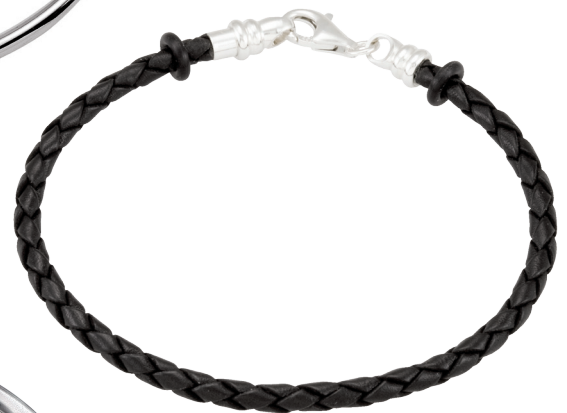
BRC649 sterling silver leather bracelet, 3.0 width, 7½", $29