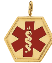
1260 14kt 22.0 width, bail ID 3.25 $749, 2.20 dwt