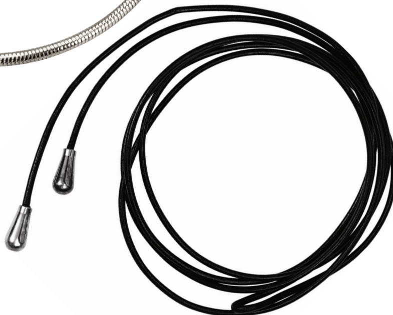
NCK174 sterling silver black leather cord lariat, 40" $29, 1.22 dwt