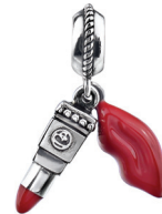
28624 sterling silver Red Lipstick 15.5x5 $79, 2.15 dwt