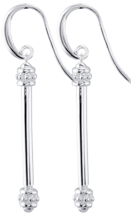
28356 sterling silver stacker earrings, 55.35 $170, 0.48 dwt