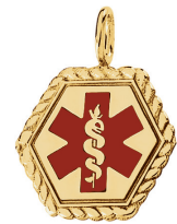
1259 14kt 19.5 width, bail ID 3.0 $575, 1.94 dwt