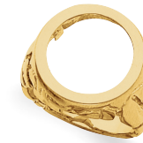
9263 14kt United States, $1.00 type 3 Mexican, 2 1/2 peso 15.5 width $2,109, 8.29 dwt