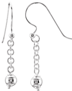
28158 sterling silver stacker earrings, 12.7 $50, 1.42 dwt