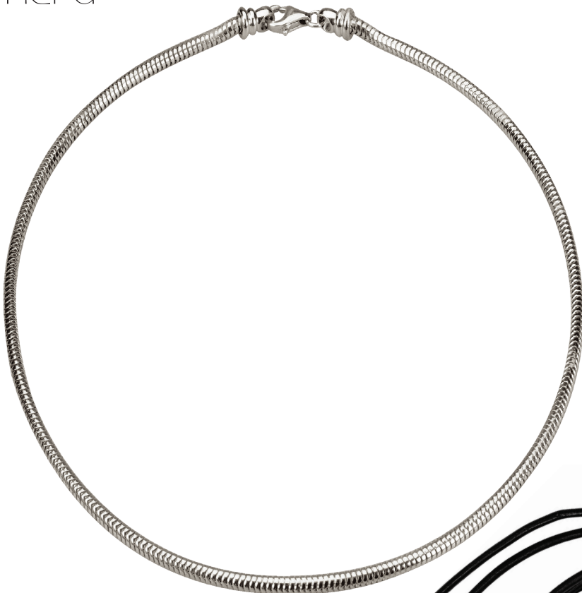
CH952 sterling silver snake necklace, 3.0 width 16", $119, 9.12 dwt 18", $135, 9.98 dwt