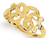
5496 "A" 14kt $555, 1.91 dwt matching pendants #8610 #8611, #8612