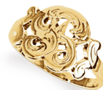
5496 "B" 14kt $505, 1.72 dwt matching pendants #8610 #8611, #8612