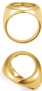
9271 14kt American Eagle, 1/10 ounce South African Rand, 1/10 ounce 13.9 width $2,009, 7.90 dwt