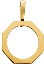
8224 14kt United States $1.00 type 3, 15x0.76 $389, 1.38 dwt