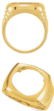
9262 14kt United States, $1.00 type 3 Mexican, 2 1/2 peso 13.9 width $2,105, 8.27 dwt