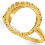
9111 14kt Chinese Panda, 1/20 ounce Isle of Man Cat, 1/25 ounce 13.0 width $595, 2.21 dwt