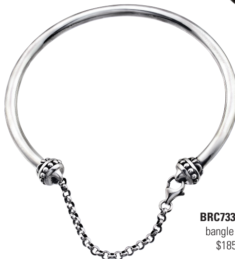
BRC733 sterling silver bangle bracelet, 7½" $185, 6.82 dwt