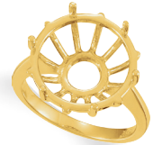
7583 14kt Chinese Panda, 1/20 ounce Isle of Man Cat, 1/25 ounce 13.9 width $745, 2.79 dwt