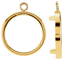
2891 14kt American Eagle 16.5x1.2 $145, 0.37 dwt