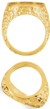
9117 14kt United States, $2.50 Chinese Panda 1/10 ounce 18.0 width $2,015, 7.92 dwt