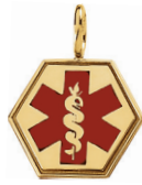
1258 14kt 16.5 width, bail ID 3.0 $585, 1.17 dwt