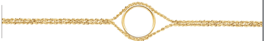
CH111 14kt American Eagle 1/10 ounce 16.5x1.2 $1,039, 2.88 dwt

Most items available in any metal quality.