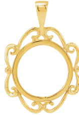
8225 14kt United States $1.00 type 1, 13x1 $415, 1.48 dwt