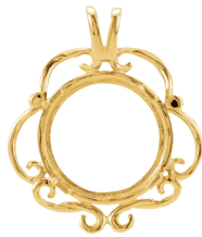
8226 14kt United States $1.00 type 1, 13x1 $399, 1.42 dwt