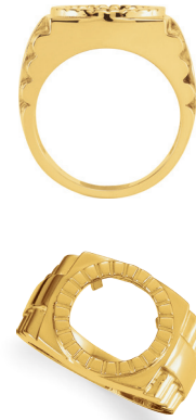
9258 14kt United States, $1.00 type 1 Mexican, 2 peso 13.0 width $2,385, 9.40 dwt