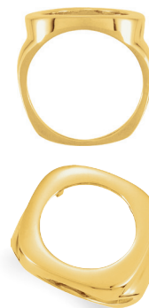
5213 14kt United States, $1.00 type 1 Mexican, 2 peso 13.9 width $1,255, 4.86 dwt