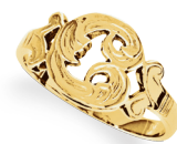
5496 "C" 14kt $535, 1.85 dwt matching pendants #8610 #8611, #8612