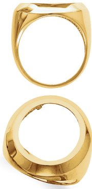
9261 14kt United States, $2.50 Chinese Panda, 1/10 ounce 17.8 width $2,155, 8.46 dwt