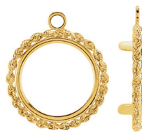
2893 14kt Chinese Panda, 1/20 ounce 13.9x0.85 $285, 0.53 dwt