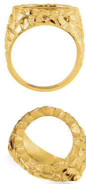
9269 14kt United States, $1.00 type 3 Mexican 2 1/2 peso 15.5 width $2,095, 8.22 dwt