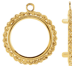
2894 14kt American Eagle, 1/10 ounce 16.5x1.2 $285, 0.72 dwt